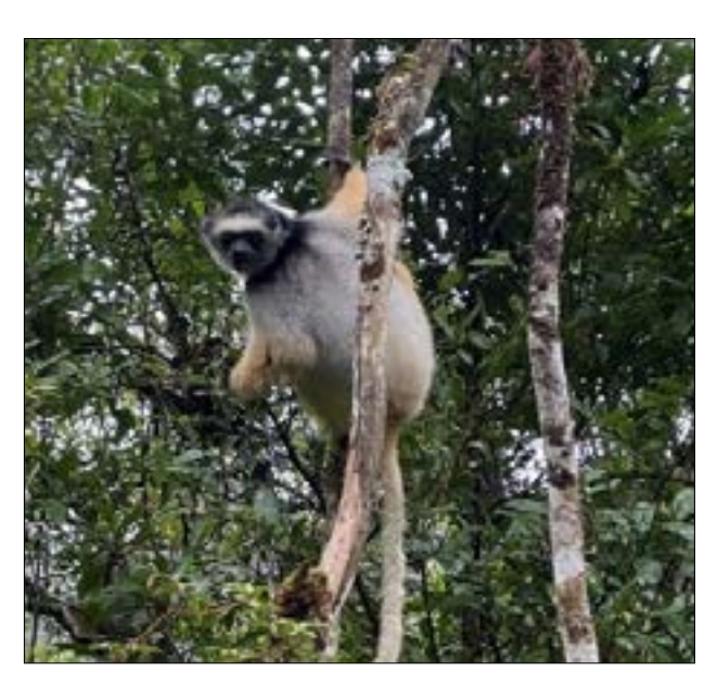
\label{eq:continuous} A juvenile \ diademed \ sifaka \ curiously \ watches \ over \ the research team.