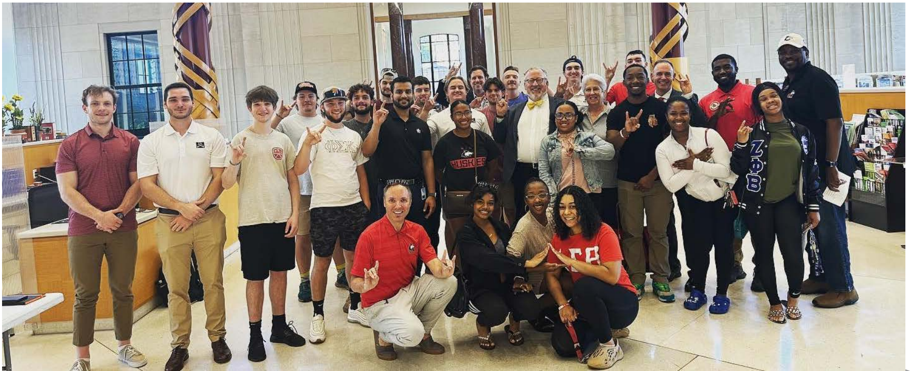
Fraternity and sorority students at the DeKalb City Council meeting, July 2023